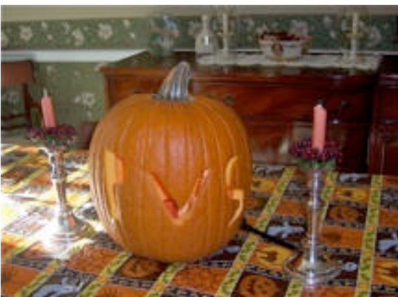
<The PVS pumpkin carver is Bob Eadie