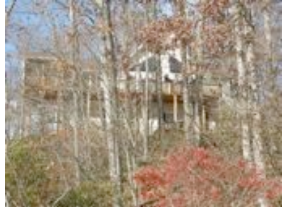
View of Miradoro from the dock