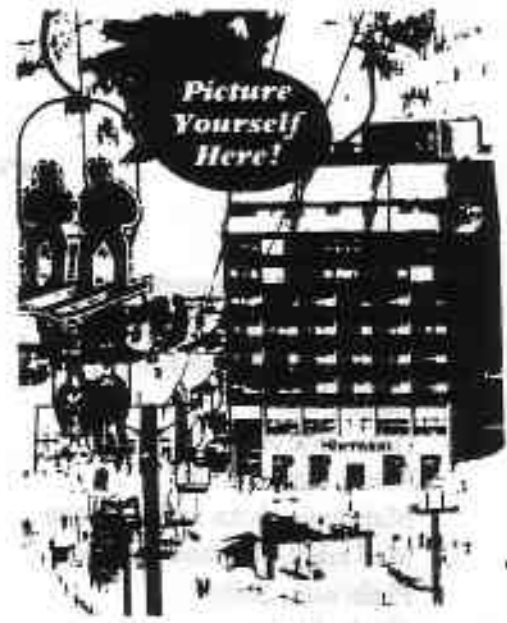
Sheraton Steamboat RESORT & CONFERENCE CENTER

Application for PVS trip to Steamboat Springs, Colorado Dec. 5 to 12, 1996