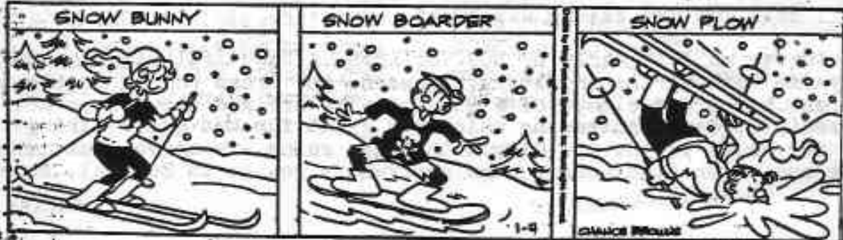
HI AND LOIS WALKER & BROWNE